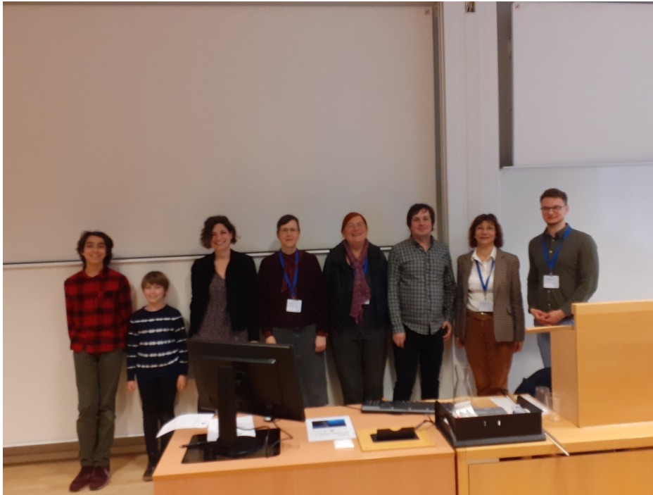
Photo: Therapy Crossing Borders panel participants