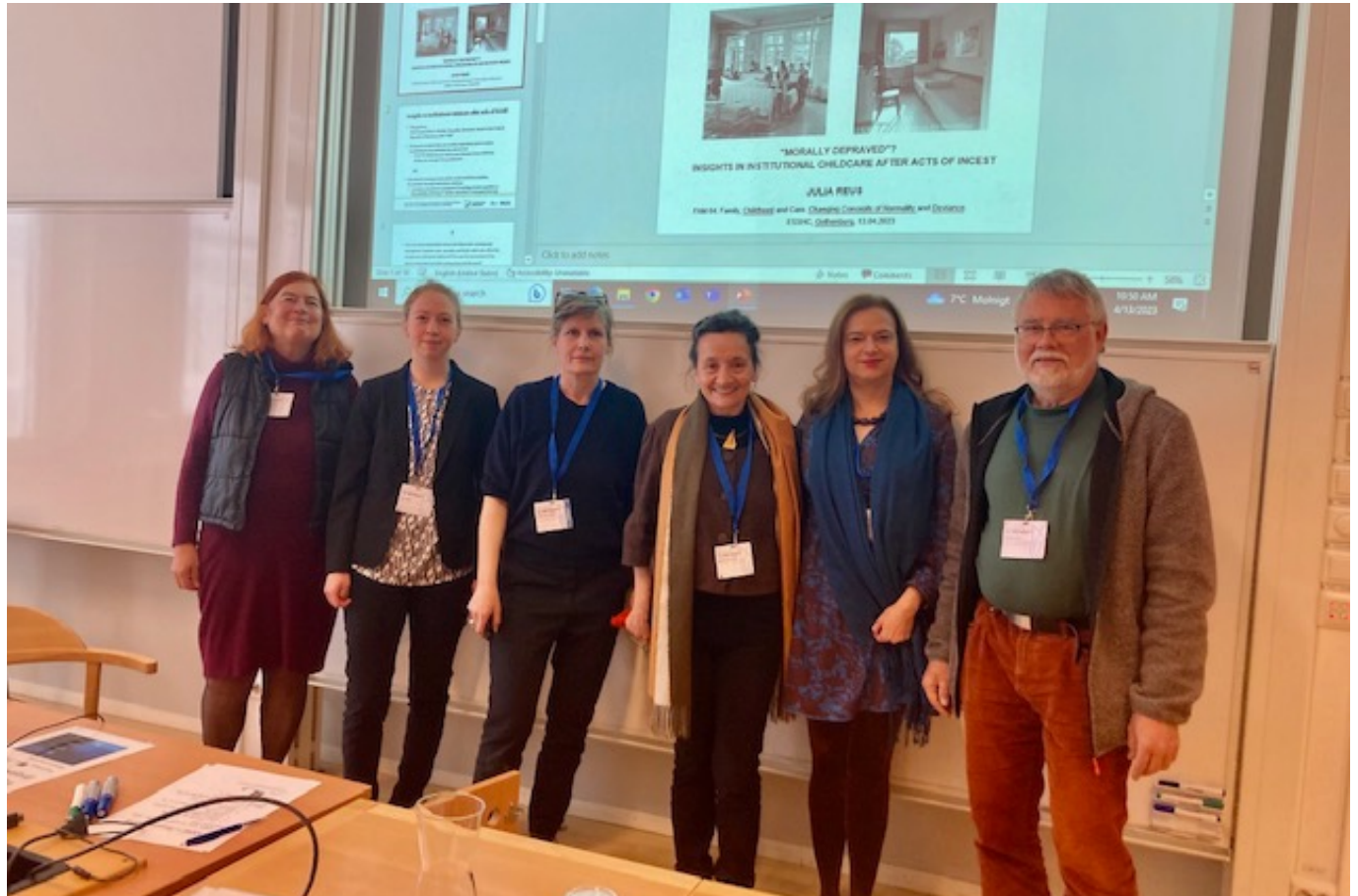
Photo: Family, Childhood, and Care panel participants