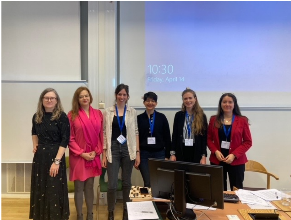
Photo: Family, Sex, and Reproduction panel participants